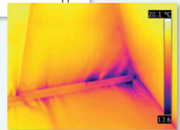
Thermogram at depressurization during the BlowerDoor test