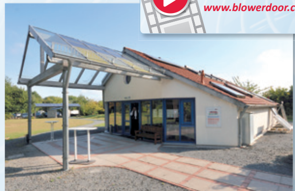
The modern training center philbus on the premises of the Energie- und Umweltzentrum